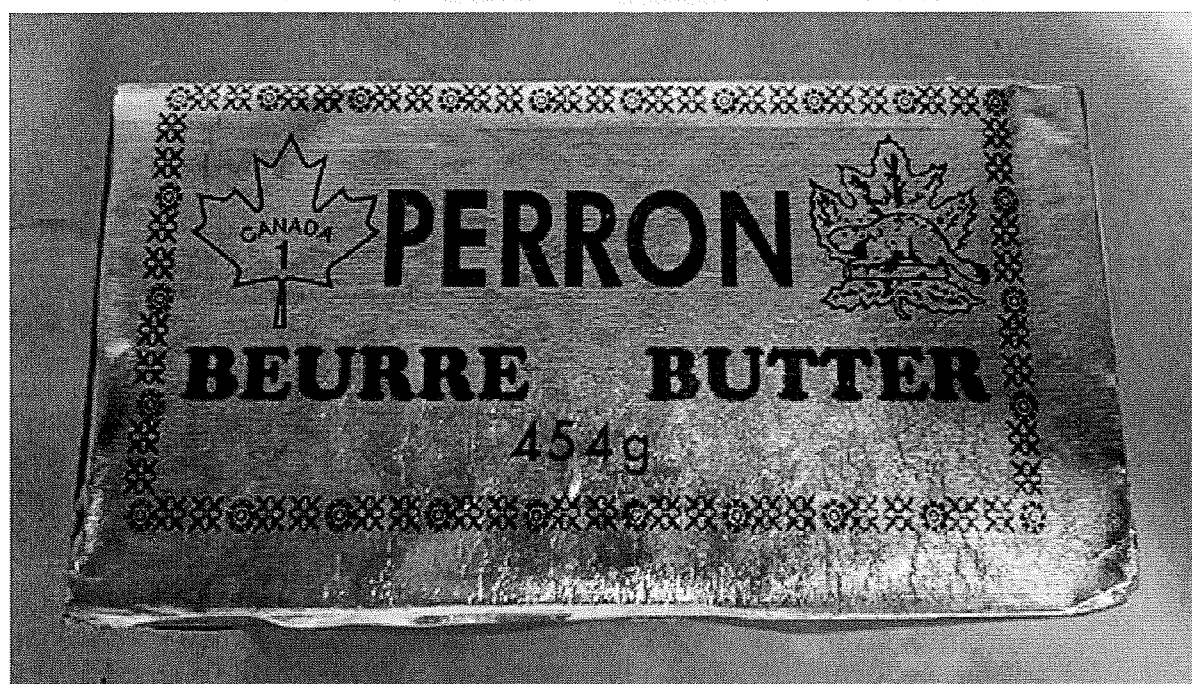
Butter - 454 gram