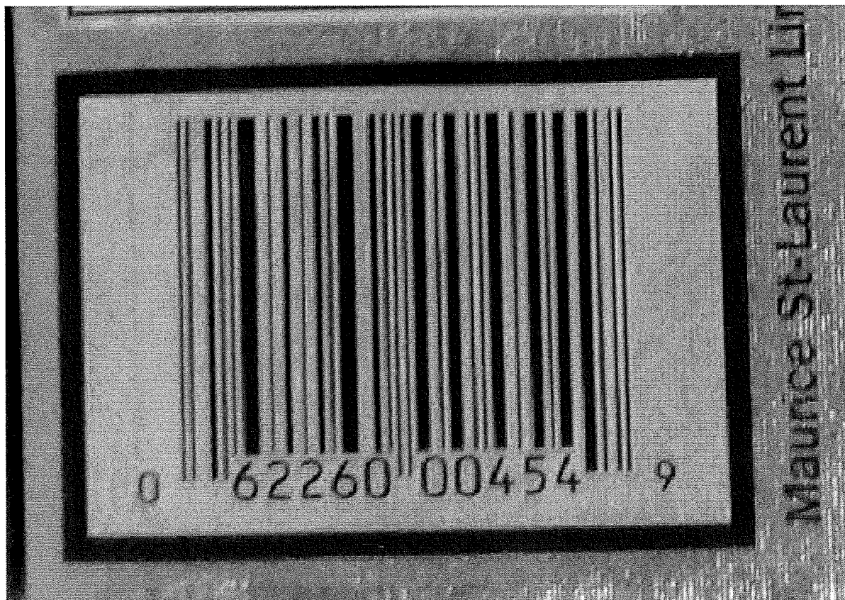
Saint Laurent - Butter - 454 gram - back