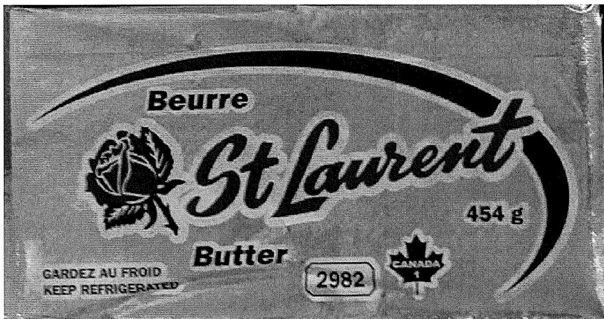
Saint Laurent - Butter - 454 gram