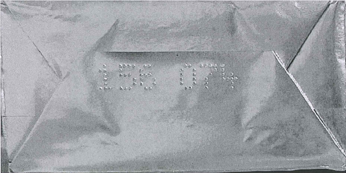
Saint Laurent - Butter - 454 gram - code