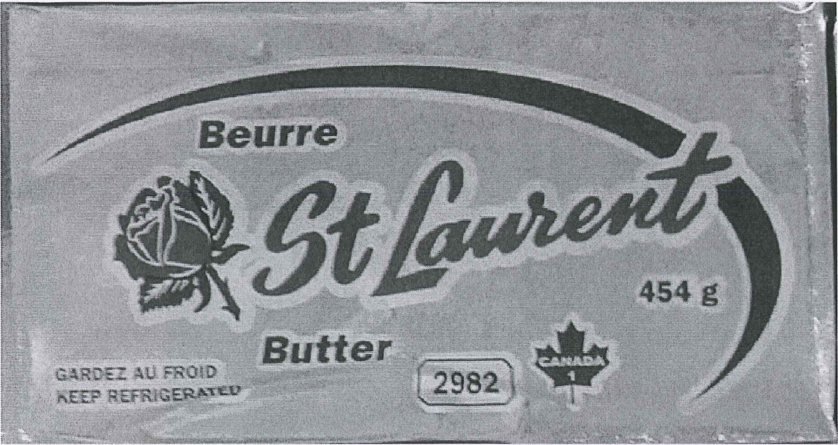
Saint Laurent - Butter - 454 gram