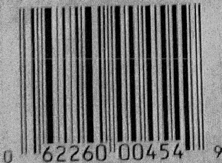
Saint Laurent - Butter - 454 gram - back

Maurice St-Laurent Limitée St-Bruno Qc GOW 2LO