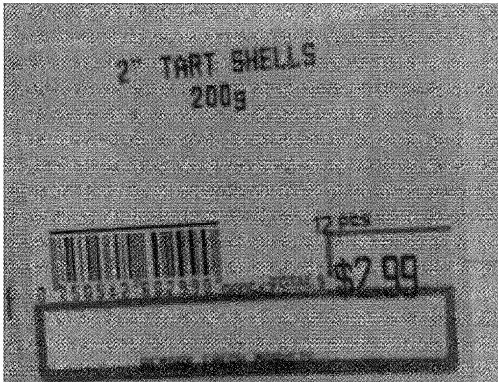
Remark Fresh Markets - 2 inch tart shells 200 grams