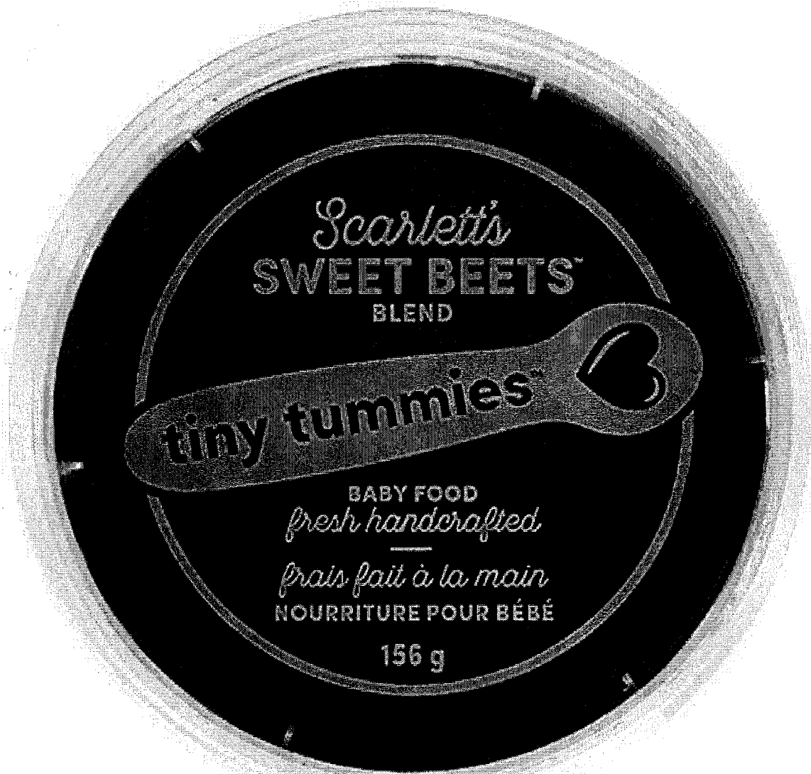
Tiny Tummies - Scarlett's Sweet Beets Blend Baby Food - top