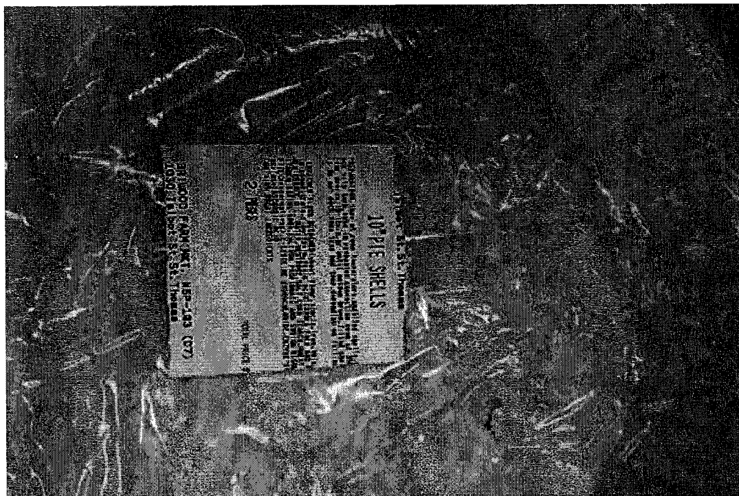
Briwood Farm Market - 10 inch Pie Shells