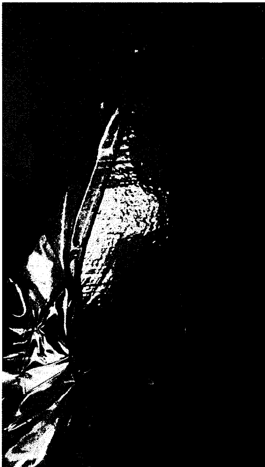
Pezzetta - Montasio DOP Cheese - top