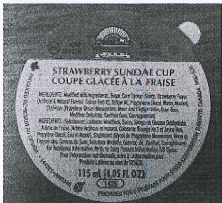
Strawberry Sundae Cup